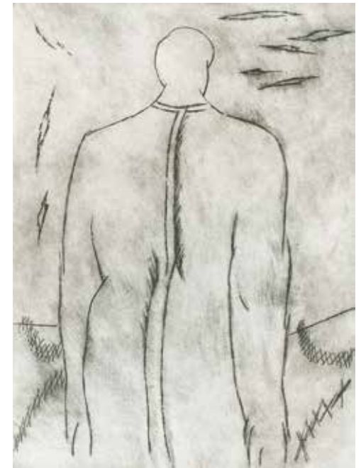
Firenze Lai , Sky and Spine , 2018, etching, 12 x 9 cm.

The title of the exhibition, White Balance , refers to the photographic process of recalibrating colours and their lighting by means of a neutral and