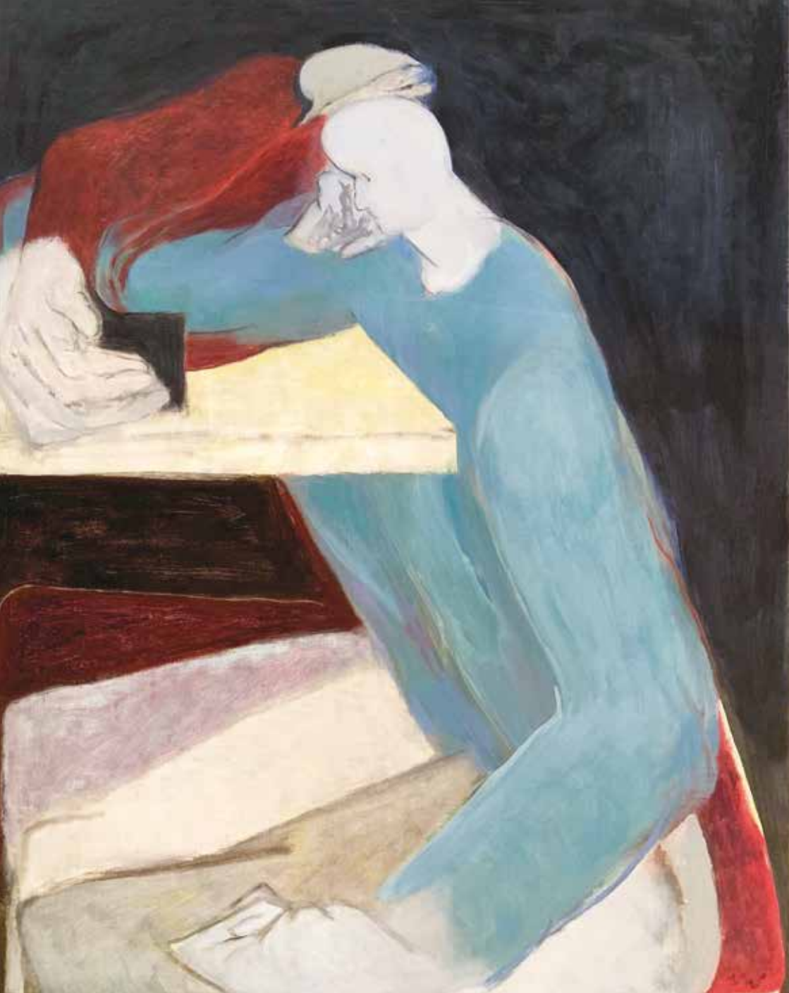
Firenze Lai , Real Reality , 2019, oil on canvas, 75 x 60 cm.

For her first solo exhibition in Europe, Firenze Lai unveils more than sixty works, between paintings, drawings and engravings, in an installation conceived for the MAMC+.