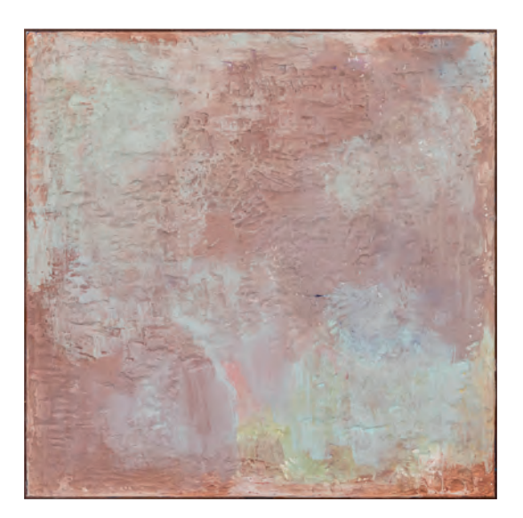
Thea Djordjadze , Untitled, 2021, wood, plaster, paint, 130 ×130 × 3.5 cm. Photo: Ingo Kniest. Courtesy Sprüth Magers. © Thea Djordjadze / VG Bild-Kunst, Bonn

On booking. For adults – 2 people minimum. Lenght: 1h15 – Price: FP 8,50 €, RP 6,50 €.